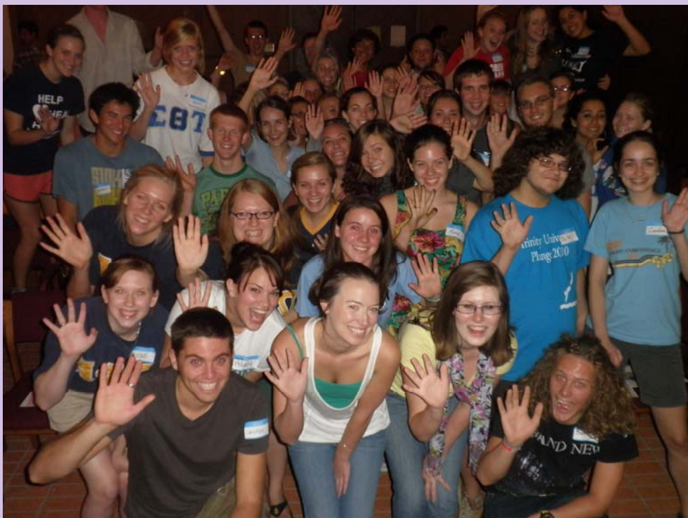
Here is a photo of the current RUF group at Trinity University. This picture was taken after a weekly Monday night "Large Group" meeting.

People ask from time to time how RUF at Trinity is doing. Are we accomplishing our goal of reaching students for Christ and equipping them to serve? It is sometimes appropriate to answer that question this way: "I'm not sure yet." Our hope is that we will one day be able to answer that question with a resounding "Yes!" An important gauge of how successful RUF is in accomplishing its goal will not be realized until we see college students graduate and faithfully plug in to their local church. RUF is "successful" if college students are faithfully serving the Lord by serving their church 15 and 20 years after leaving college. RUF is sent to the campus by the church and for the sake of the church. Please continue to pray that God would use the ministry of RUF to grow the church.